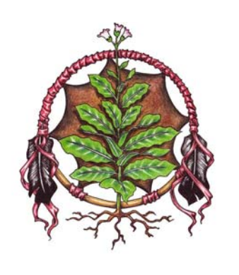
With 79% of Minnesotans as nonsmokers, their visits to casinos are subjecting them to carcinogens that are harmful to their health.

secondhand smoke in nonsmokers who visited casinos for an average of a little over four hours. The study measured a tobacco specific carcinogen, NNK. "The study found that, on average, the levels of NNK metabolites were increased two fold (112%) demonstrating that exposure of nonsmokers to ETS [secondhand smoke] in a public setting results in uptake of a tobacco-specific lung carcinogen." This study is evidence that customers, employees, and tribal members are being subjected to known carcinogens that cause illnesses and death. This exposure has the potential to be prevented with the expansion of smoke-free policies. With 79% of Minnesotans as nonsmokers, their visits to casinos are subjecting them to carcinogens that are harmful to their health.