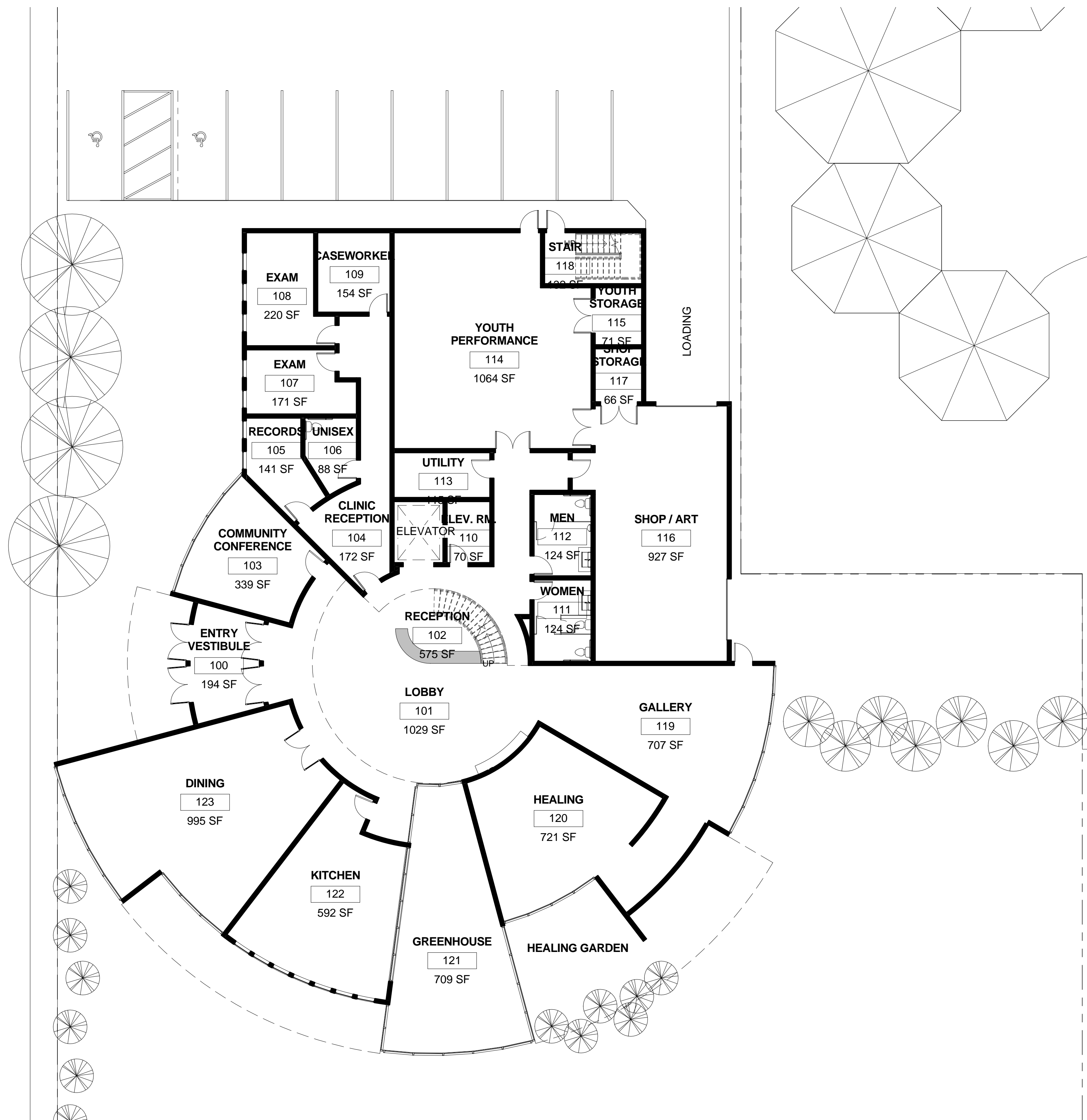
① MAIN LEVEL FLOOR PLAN 3/32" = 1'-0"