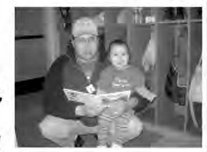
Certified CPR and First Aide providers

WECCLC offers daily learning experiences in art, sensory play, large motor, small motor and socialization